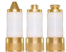
Contact applicators Contact surface Ø 3, 5, 7 mm