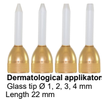
Dermatological applicators Glass tip Ø 1, 2, 3, 4 mm Length 22 mm